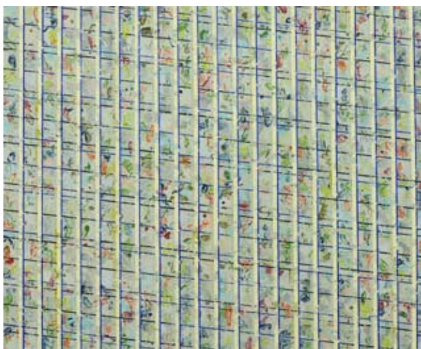
Top: Othello , 2011 oil and acrylic on linen 34 x 43 in.